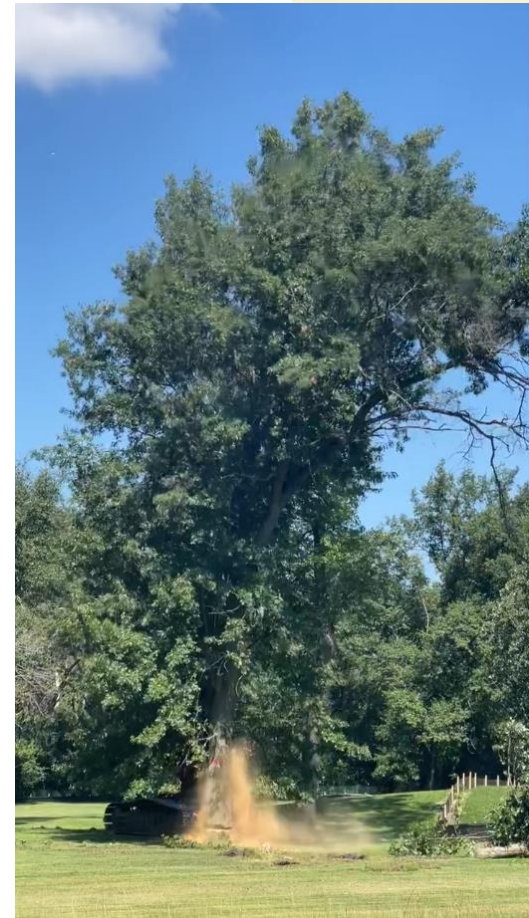
Homer Companies operates heavy equipment to safely remove trees. It is important for anyone not associated with the project to stay off the site and remain safe.