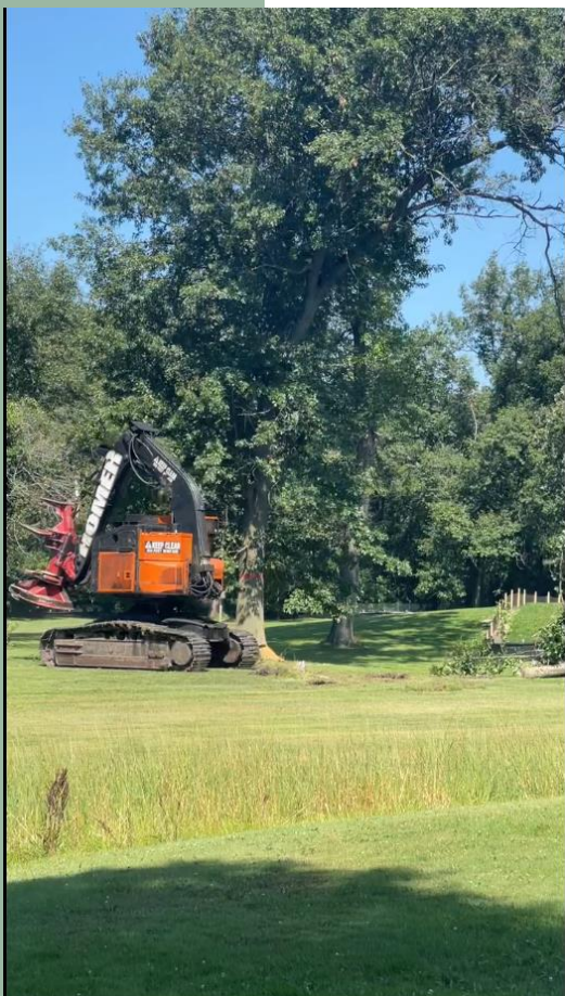
Trees are being removed to make room for the Par 3 Aboveground Storage Facility.