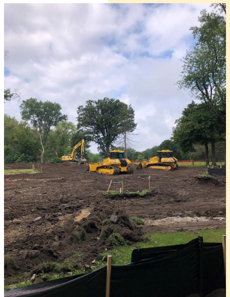
DiMeo stripped, stockpiled, and transferred topsoil from the Par 3 Course using dozers and backhoes.