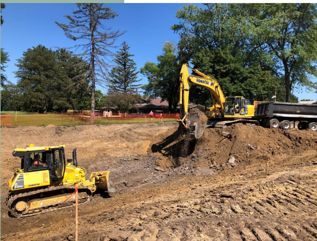
Heavy earth excavation of the Par 3 Storage Facility has begun. Please watch out for truck traffic carrying the spoils.

WILLOW ROAD TRAFFIC NOTICE: Excavated soils will continue to be trucked across Willow Road causing temporary traffic congestion and increased travel times. Please consider using alternate routes.