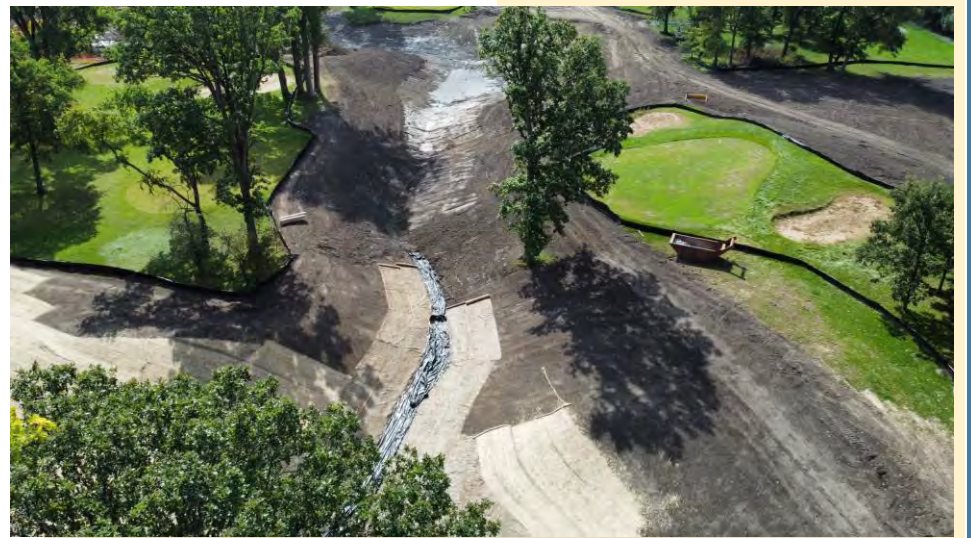
Turf reinforcement mat, topsoil, and riprap were placed on the slopes of the new Par 3 Storage Facility.