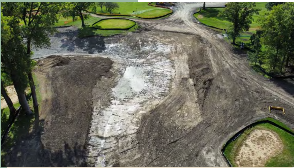
Heavy earth excavation of the Par 3 Storage Facility continued into the new ponds.

WILLOW ROAD TRAFFIC NOTICE: Excavated soils will continue to be trucked across Willow Road causing temporary traffic congestion and increased travel times. Please consider using alternate routes.