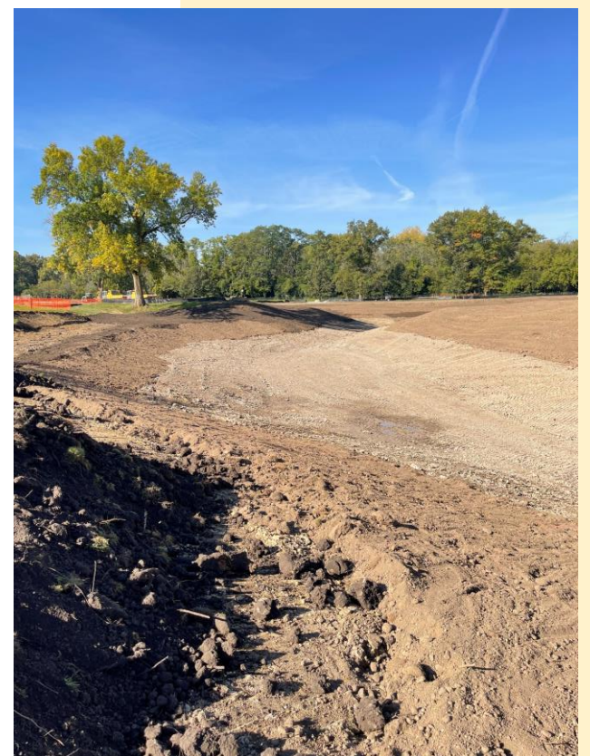
Soils have been continually dried out and stabilized after excavation.