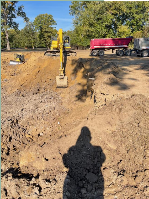
DiMeo continued heavy earth excavation of the new Par 3 Pond.

WILLOW ROAD TRAFFIC NOTICE: Excavated soils will continue to be trucked across Willow Road causing temporary traffic congestion and increased travel times. Please consider using alternate routes.