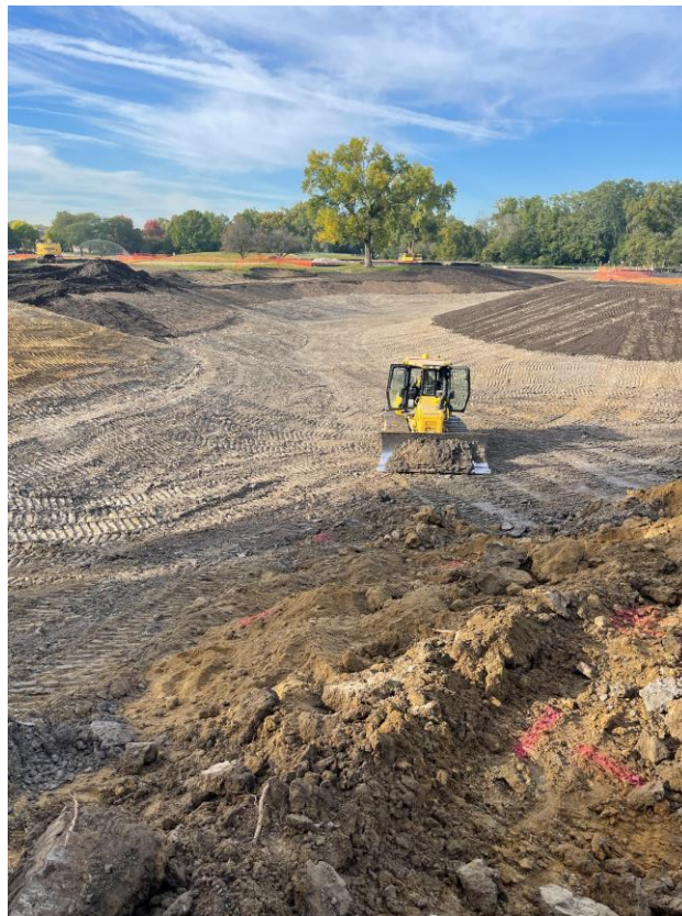
The Par 3 Storage Facility, when complete, will store about 22 acre-feet of stormwater!