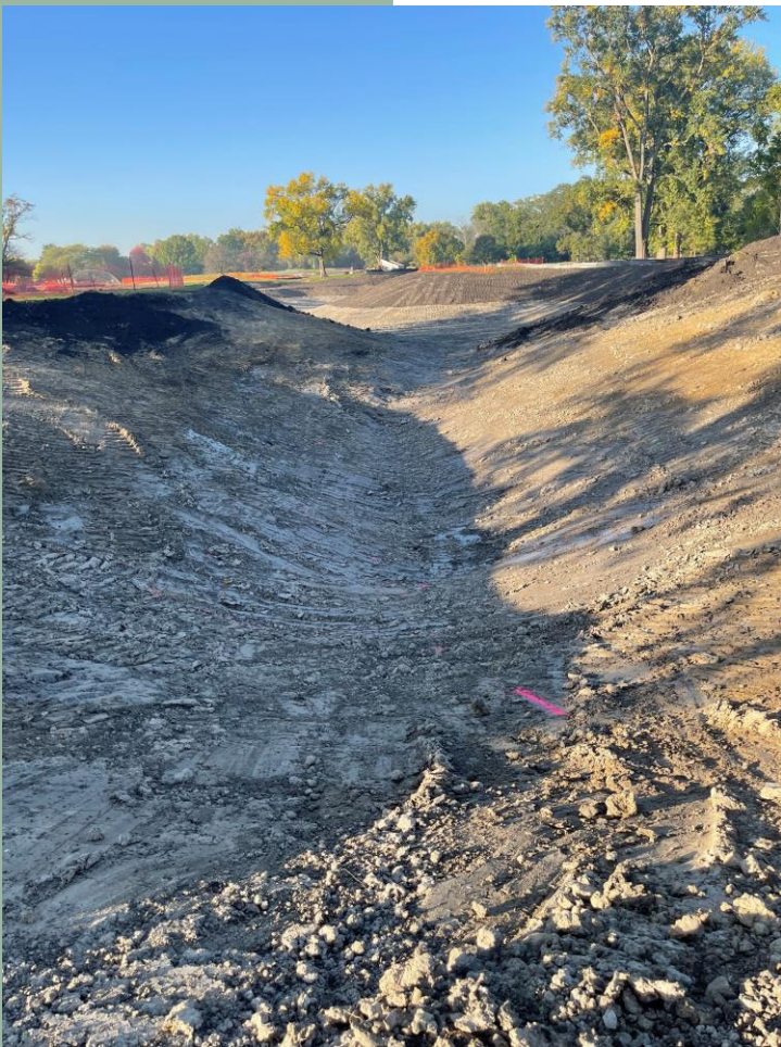
The last part of the Par 3 Storage Facility was excavated this week

WILLOW ROAD TRAFFIC NOTICE: Excavated soils will continue to be trucked across Willow Road causing temporary traffic congestion and increased travel times. Additionally , StormTrap underground units will be delivered onsite via Willow Road. Please consider using alternate routes.