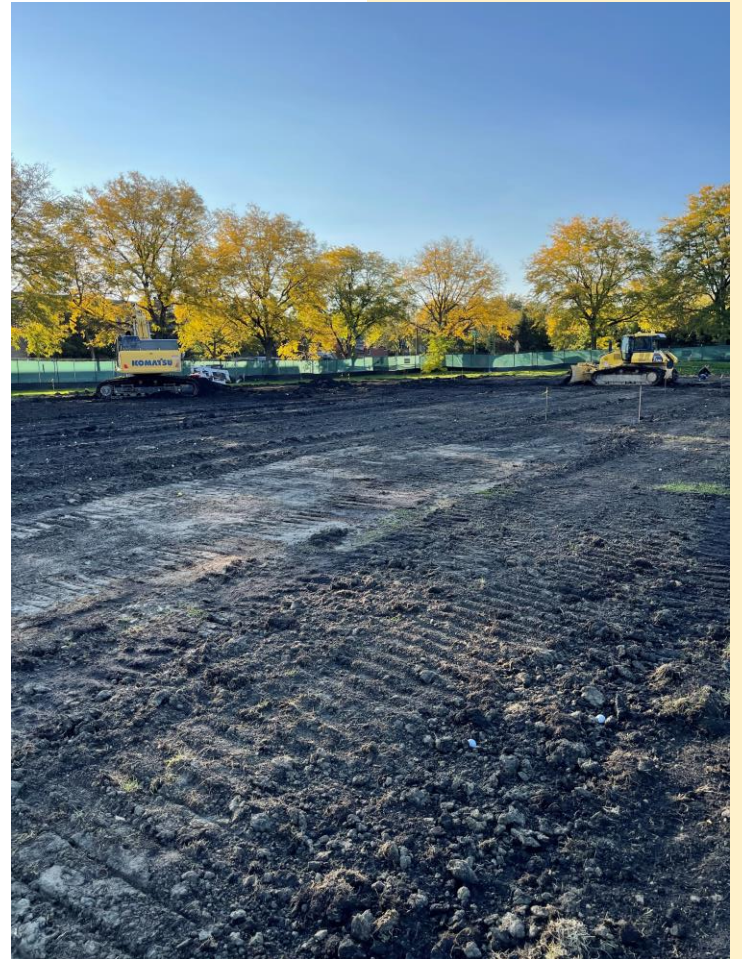
DiMeo began scraping topsoil off Duke Childs Field