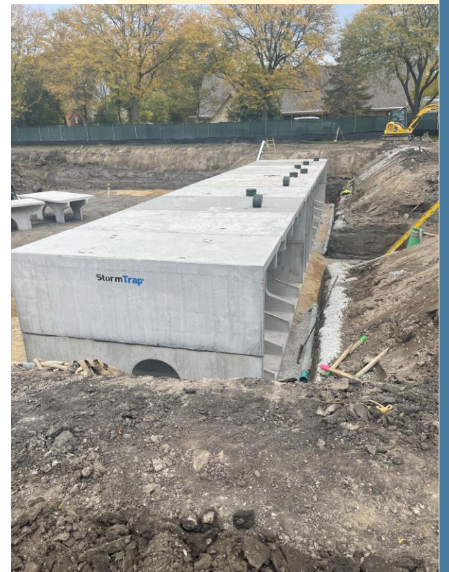
The Duke Childs Underground Storage Facility will hold over 4.6 million gallons of stormwater.