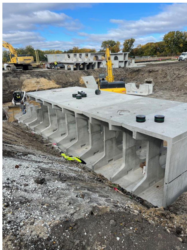
DiMeo excavates the soil, lays out a stone bedding, and then places the pieces in Duke Childs Field.