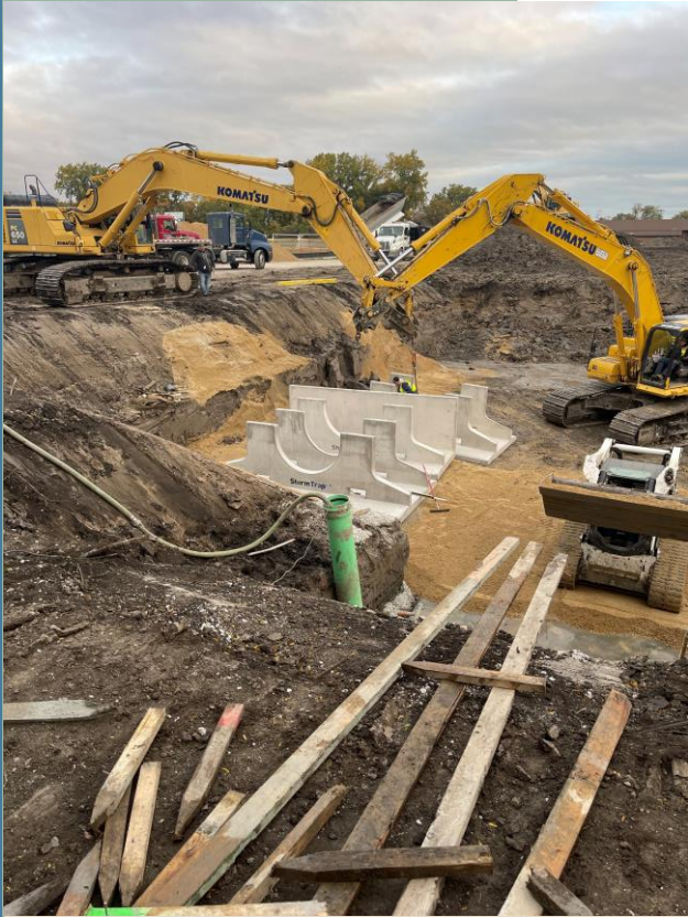
Delivery of the StormTrap units began in earnest this week!

WILLOW ROAD TRAFFIC NOTICE: Excavated soils will continue to be trucked across Willow Road causing temporary traffic congestion and increased travel times. Additionally , StormTrap underground units will be delivered onsite via Willow Road. Please consider using alternate routes.