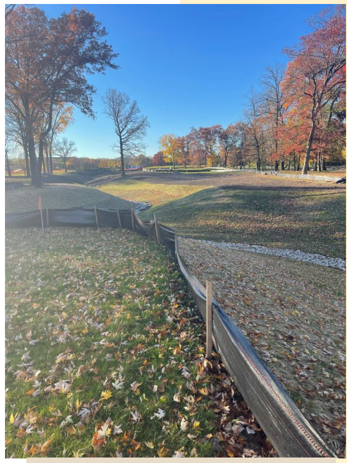
The Par 3 Channel has been stabilized in time for leaves to fall