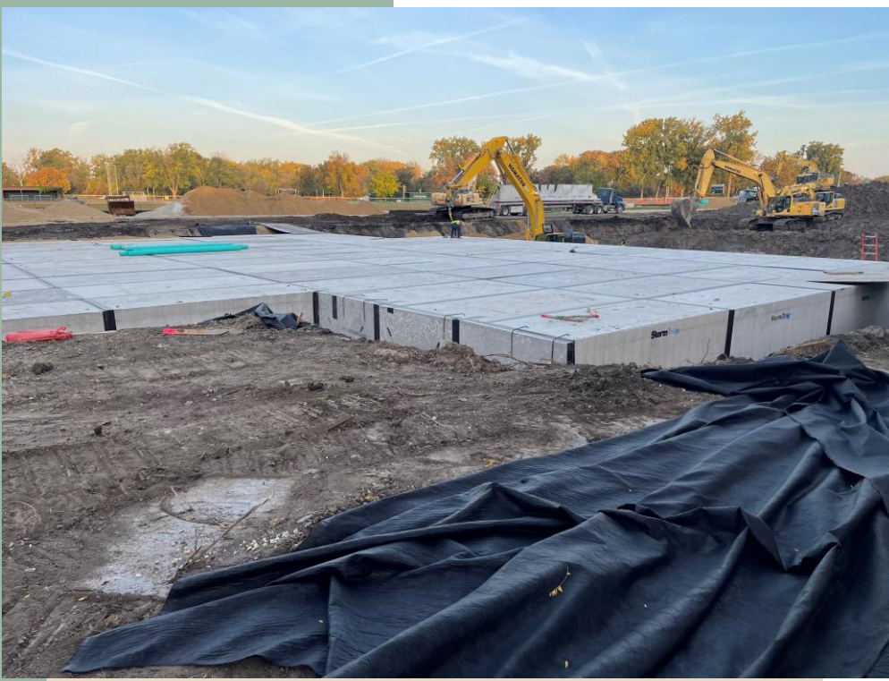
DiMeo continued to install StormTrap units in Duke Childs Field

WILLOW ROAD TRAFFIC NOTICE: Excavated soils will continue to be trucked across Willow Road causing temporary traffic congestion and increased travel times. Additionally , StormTrap underground units will be delivered onsite via Willow Road. Please consider using alternate routes.