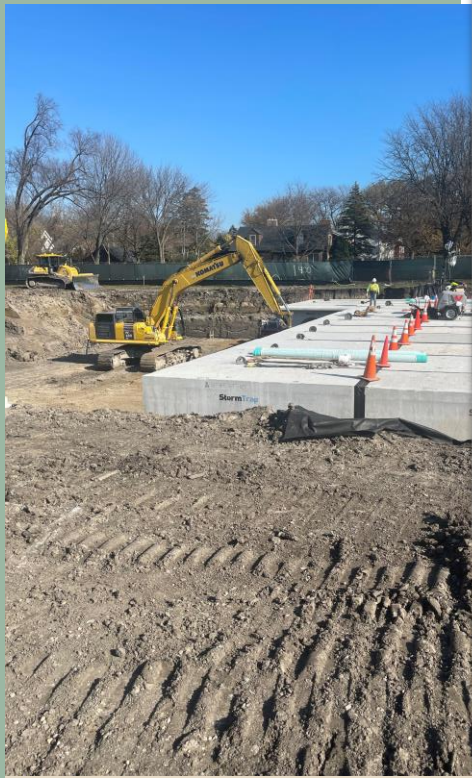
The Duke Childs Underground Storage Facility will hold nearly 4.7 million gallons of stormwater

WILLOW ROAD TRAFFIC NOTICE: Excavated soils will continue to be trucked across Willow Road causing temporary traffic congestion and increased travel times. Additionally , StormTrap underground units will be delivered onsite via Willow Road. Please consider using alternate routes.