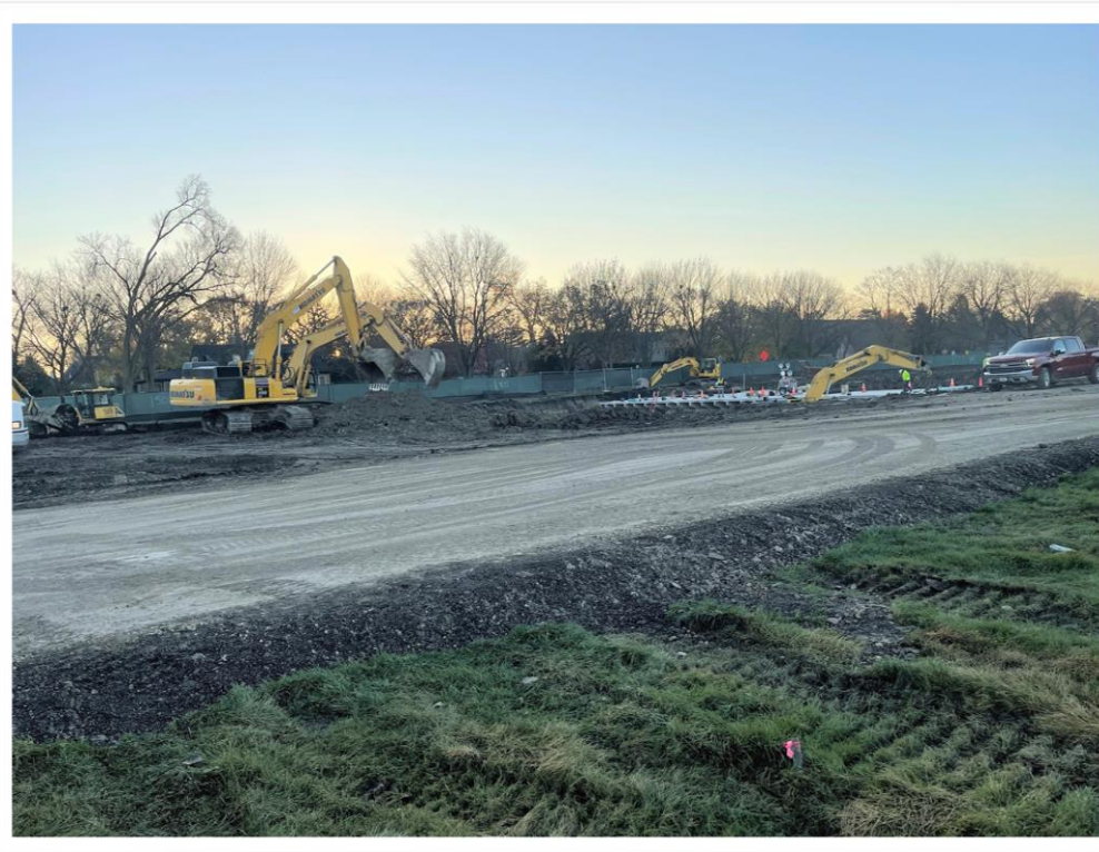
DiMeo operators work diligently to dig, haul, place, and set StormTrap units in Duke Childs Field