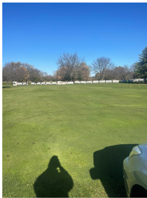
Delivery of storm sewer pipe to the 18 Hole Course began this week