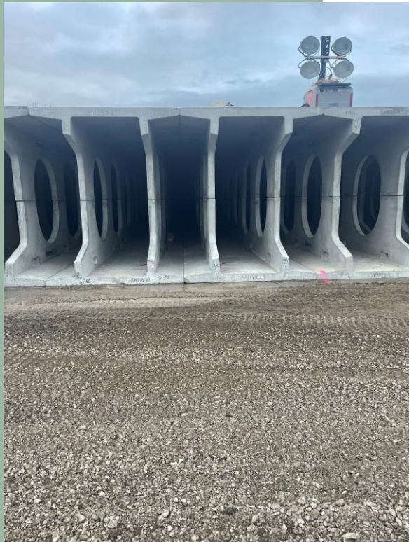
The Duke Childs Underground Storage Facility stands at nearly 10 feet tall

WILLOW ROAD TRAFFIC NOTICE: Excavated soils will continue to be trucked across Willow Road causing temporary traffic congestion and increased travel times. Additionally , StormTrap underground units will be delivered onsite via Willow Road. Please consider using alternate routes.