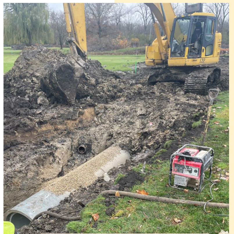
The 18 Hole Course overflow storm sewer began installation