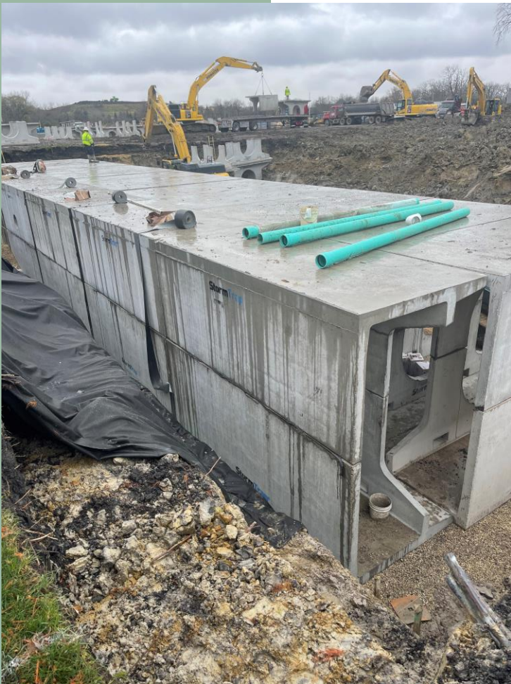
Little Duke StormTrap installation began in earnest

WILLOW ROAD TRAFFIC NOTICE: Excavated soils will continue to be trucked across Willow Road causing temporary traffic congestion and increased travel times. Also , StormTrap underground units will be delivered onsite via Willow Road. Please consider using alternate routes and respect flaggers.