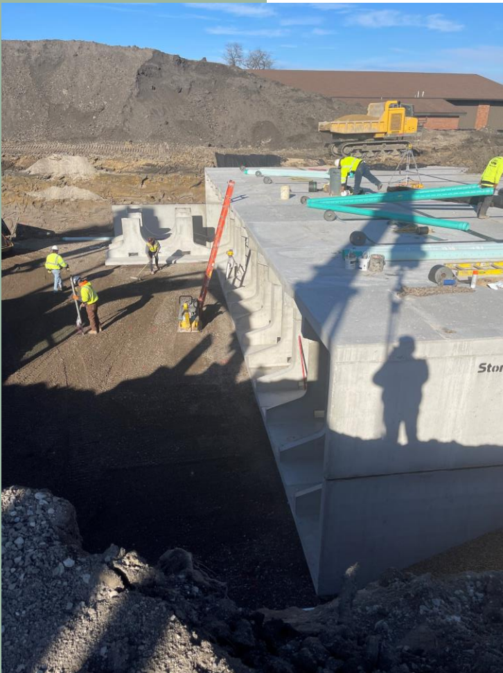
Little Duke StormTrap installation is complete! It will hold over 2 million gallons of stormwater

WILLOW ROAD TRAFFIC NOTICE: Although construction will pause for Thanksgiving, excavated soils will continue to be trucked across Willow Road again on Monday, November 28. Please consider using alternate routes and respect flaggers.