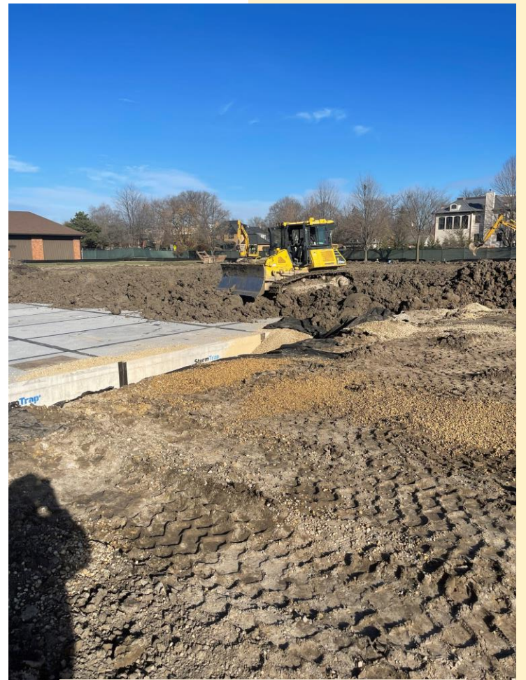
DiMeo backfilled the Little Duke Facility in time for the holiday