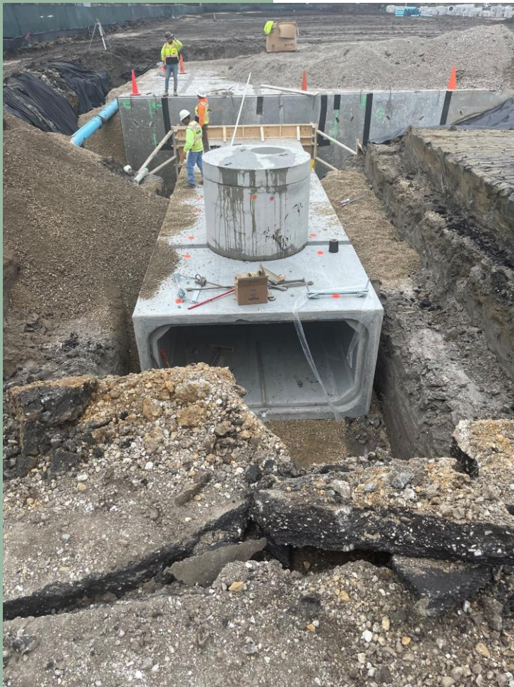
Now that the two StormTrap systems are complete, DiMeo worked to connect them

WILLOW ROAD TRAFFIC NOTICE: Excavated soils will continue to be trucked across Willow Road causing temporary traffic congestion and increased travel times. Please consider using alternate routes and respect flaggers.