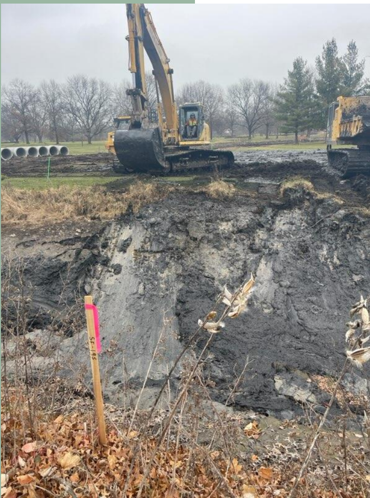
Dewatering, topsoil stripping, and the beginning of excavating Hole No. 17

HIBBARD ROAD CLOSURE NOTICE: During the Winnetka School District Winter Break (December 23 to January 8), Hibbard Road will be closed for construction between Willow Road and Elm Street. Please follow posted detour routes and use caution while driving in this area.