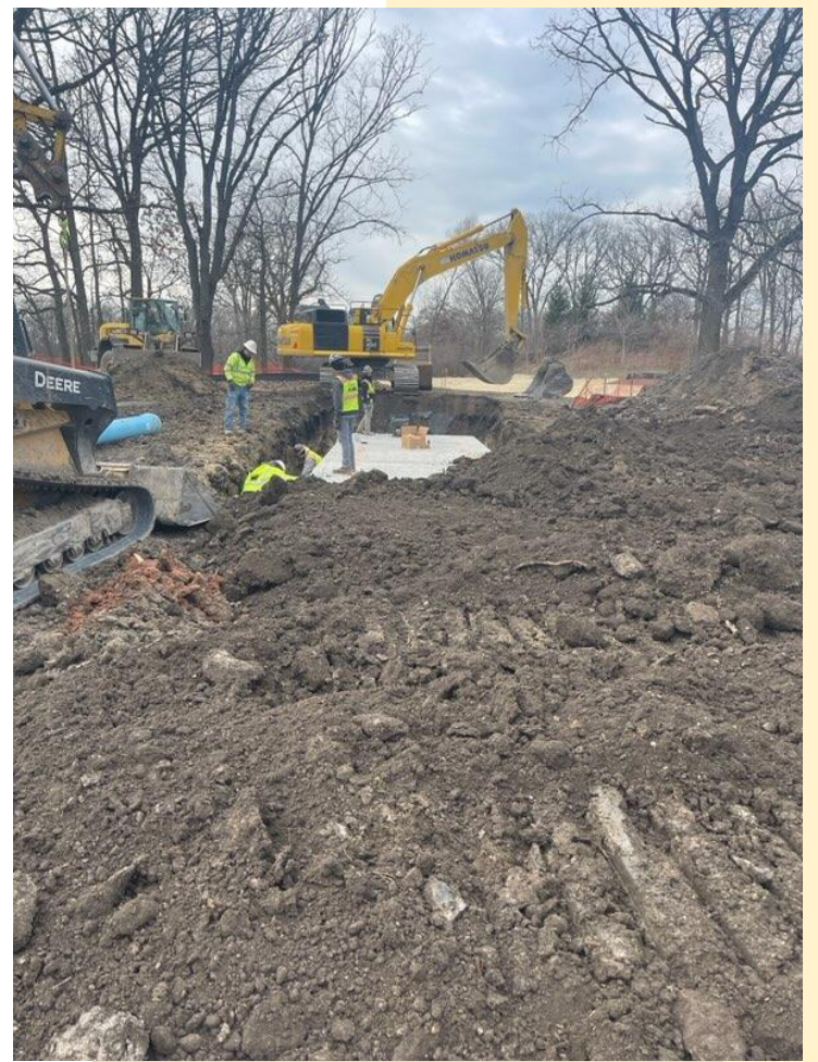
Constructing the box culvert between Little Duke StormTrap and the Par 3 Storage Facility