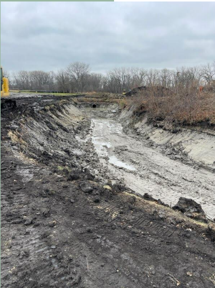
Dewatering and excavating Pond No. 17

HIBBARD ROAD CLOSURE NOTICE: Hibbard Road will be closed for construction between Willow Road and Elm Street starting on December 26 th and ending on January 8 th . Please follow posted detour routes and use caution while driving in this area.