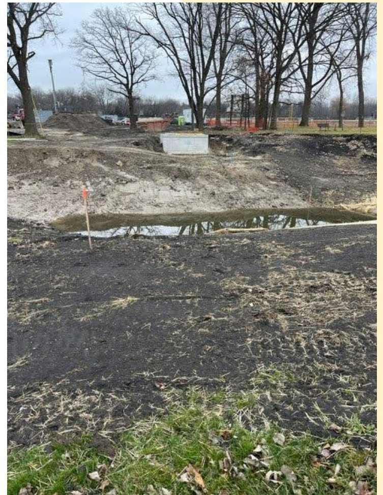
End of the box culvert between Little Duke StormTrap and the Par 3 Storage Facility