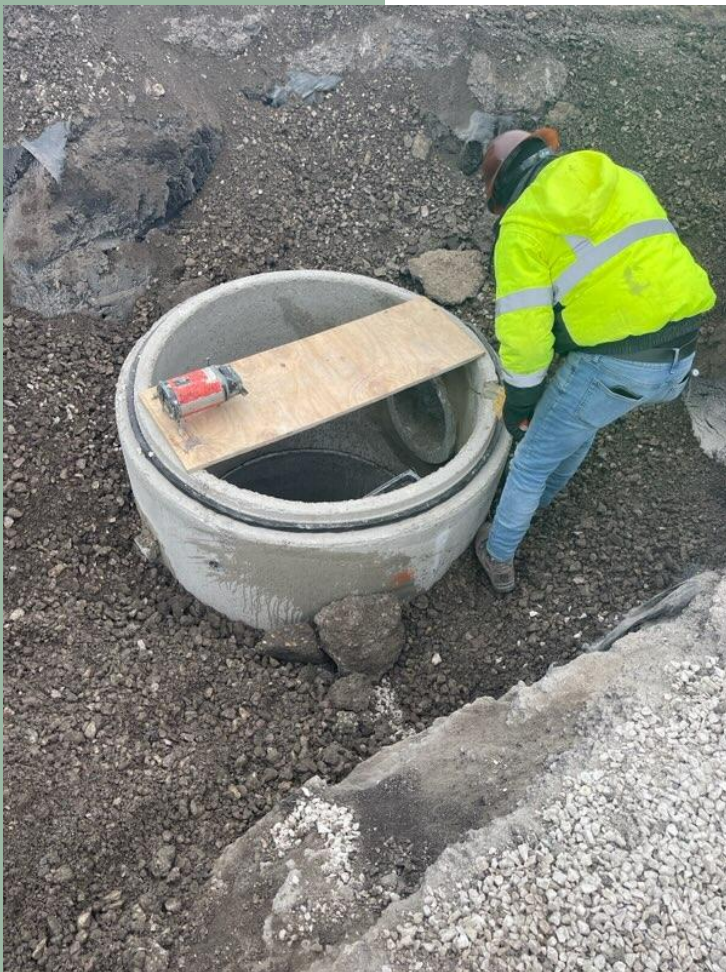
Installation of storm manholes in Duke Childs parking lot bioswale

HIBBARD ROAD CLOSURE NOTICE: Hibbard Road will be closed for construction between Willow Road and Elm Street starting on December 26 th and ending on January 8 th . Please follow posted detour routes and use caution while driving in this area.