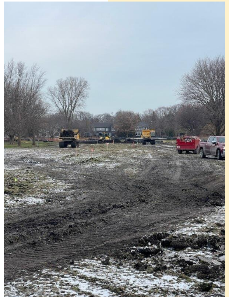
Site preparation for placement of fill on No. 12