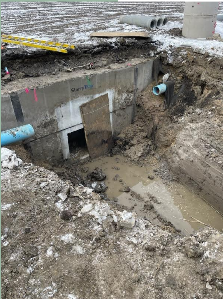
Opening in Storm Trap for Ash Street box culvert

HIBBARD ROAD NOTICE: Hibbard Road will reopen on January 9 th . Normal traffic routes will resume.