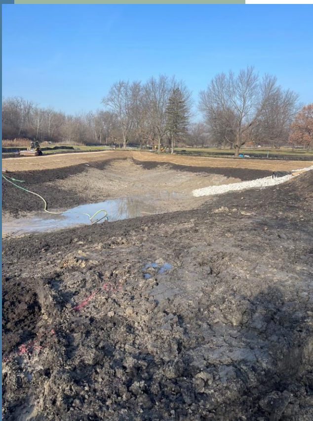
DiMeo began stabilizing the fully-excavated Hole No. 17