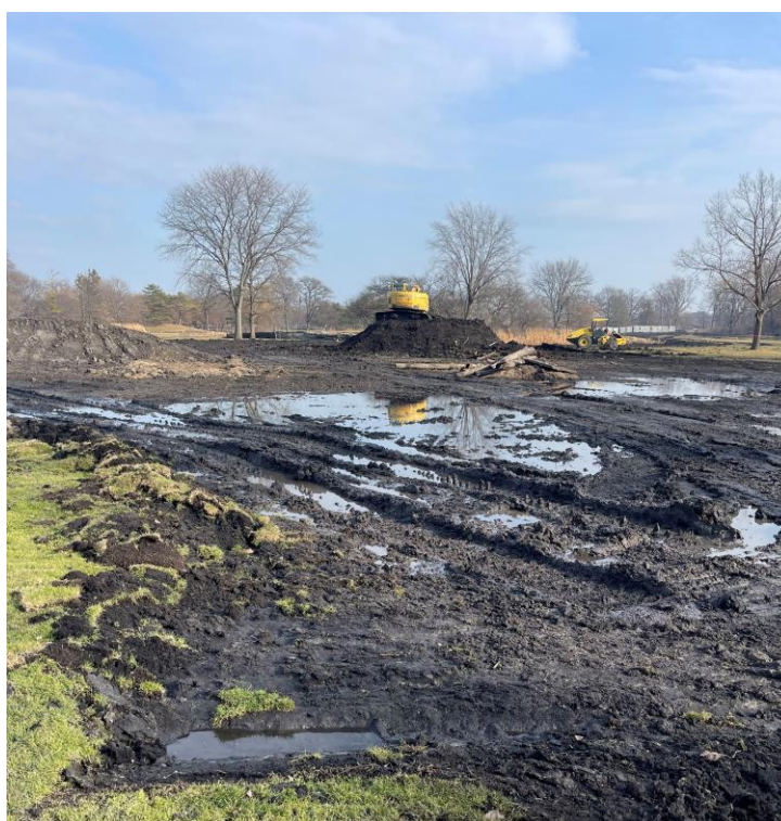
Excavation of the 18 th Hole Storage Facility has begun!