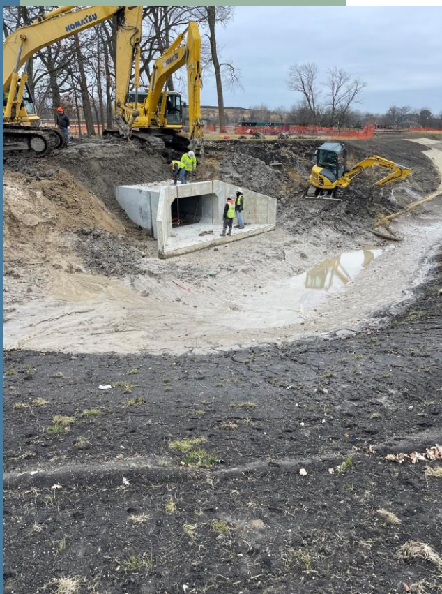
A large 10'x5' precast end section connects Par 3 & Little Duke