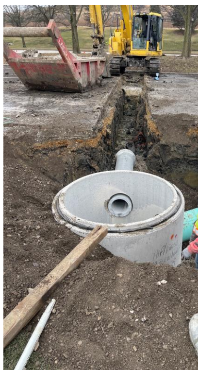
Local storm sewers around Duke and Little Duke were completed