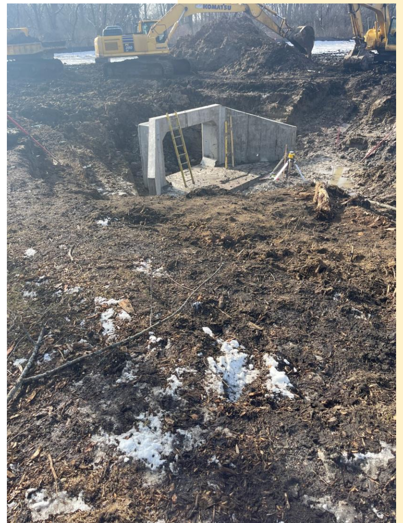
The first end section connecting the 18 th Hole to the Par 3 Course