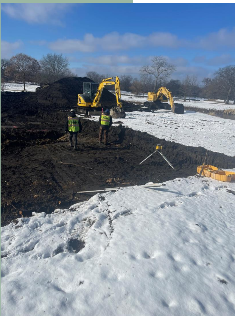
DiMeo began placing topsoil to finished grade on Duke Childs