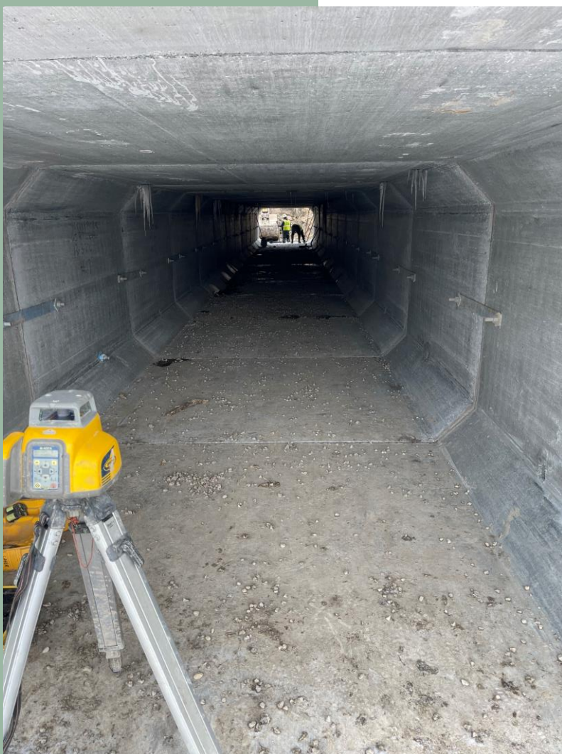
A view from inside the 10'x6' box culvert connecting the 18-Hole & Par 3 Courses