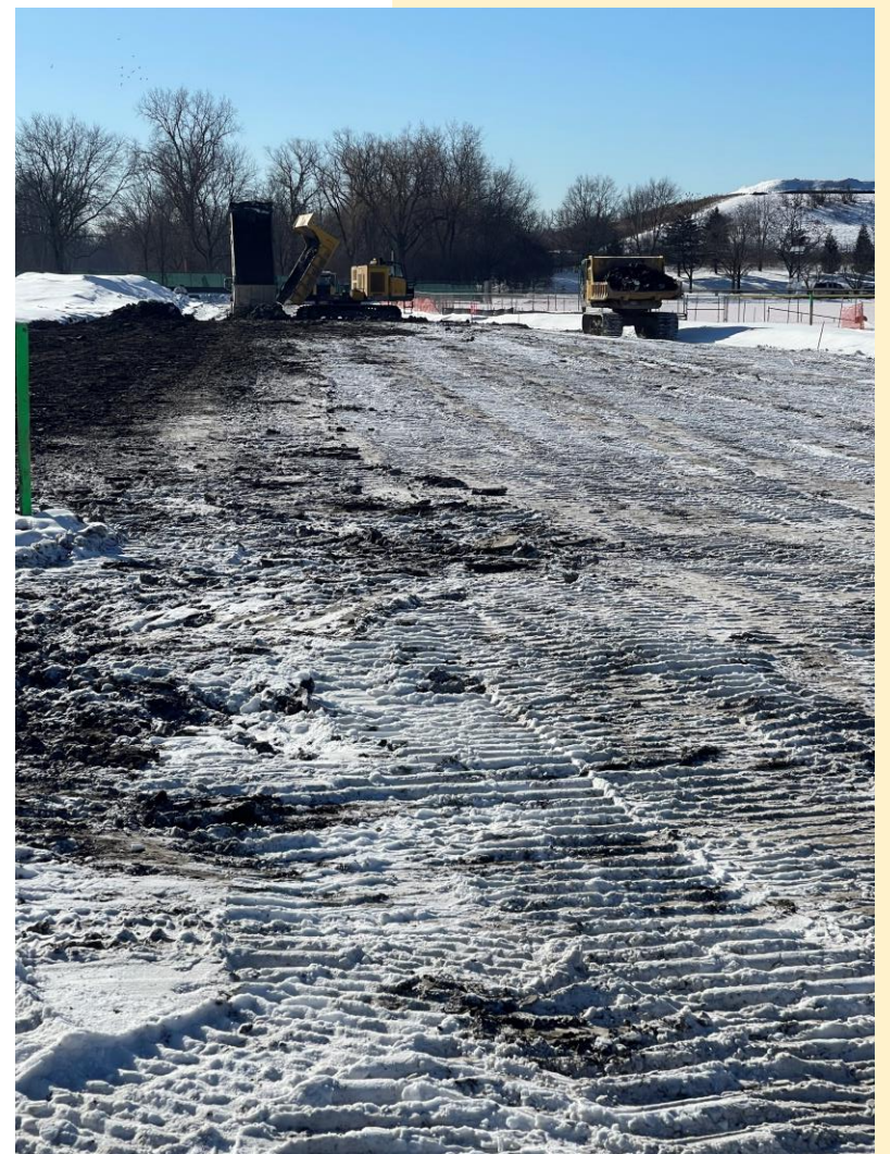
DiMeo brings topsoil to perform final grading on Duke Childs Field