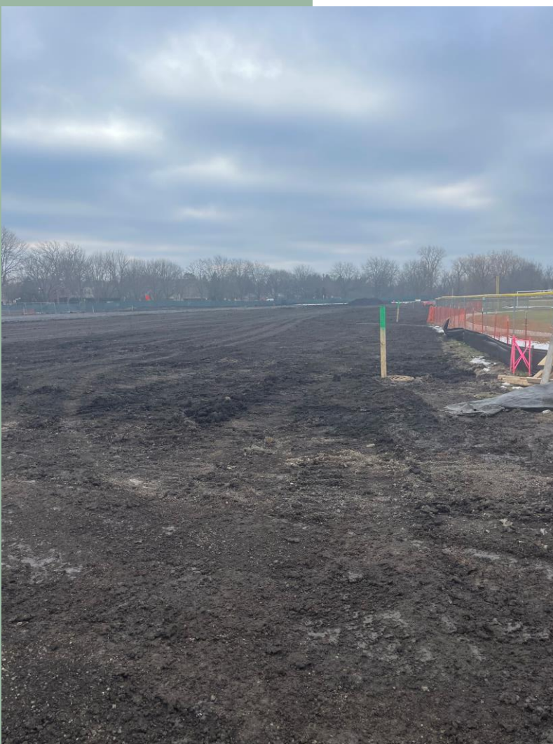
Topsoil placement on Duke Childs Field has been completed