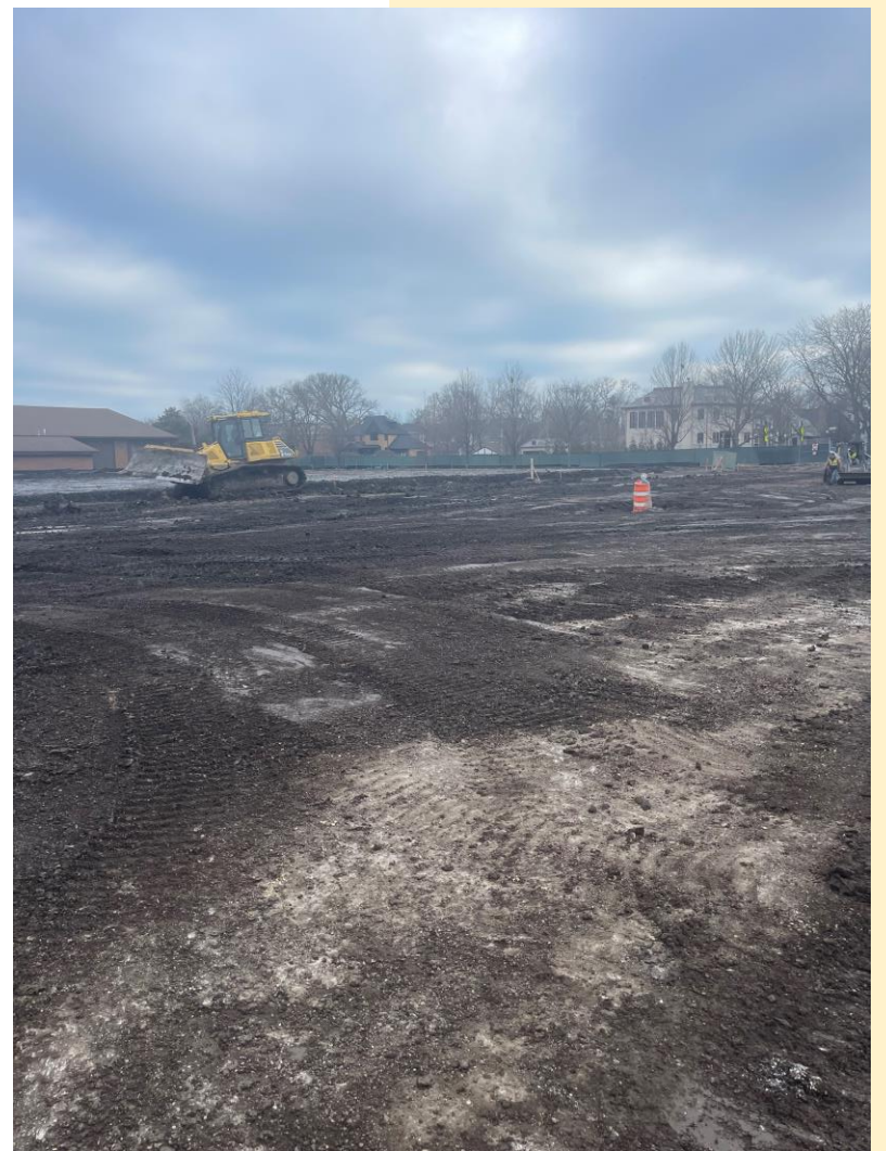
The Duke Childs Parking Lot is nearly prepared for New Trier takeover in June