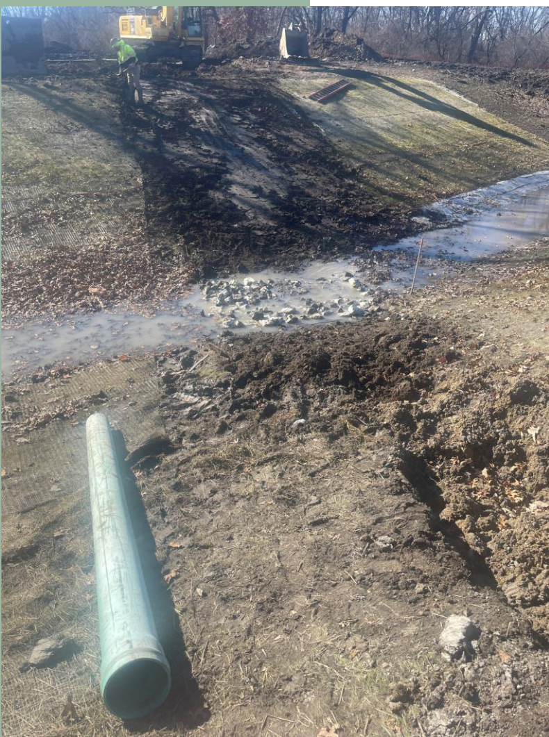
DiMeo has nearly completed the WGC Clubhouse sanitary service