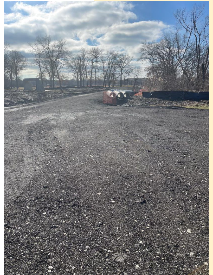
A haul road between the Par 3 and 18-Hole courses will improve traffic flow and excavation efforts