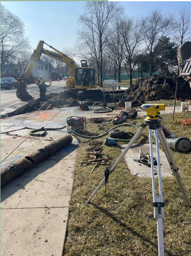
Oak Street water main work will greatly improve the Village's distribution system