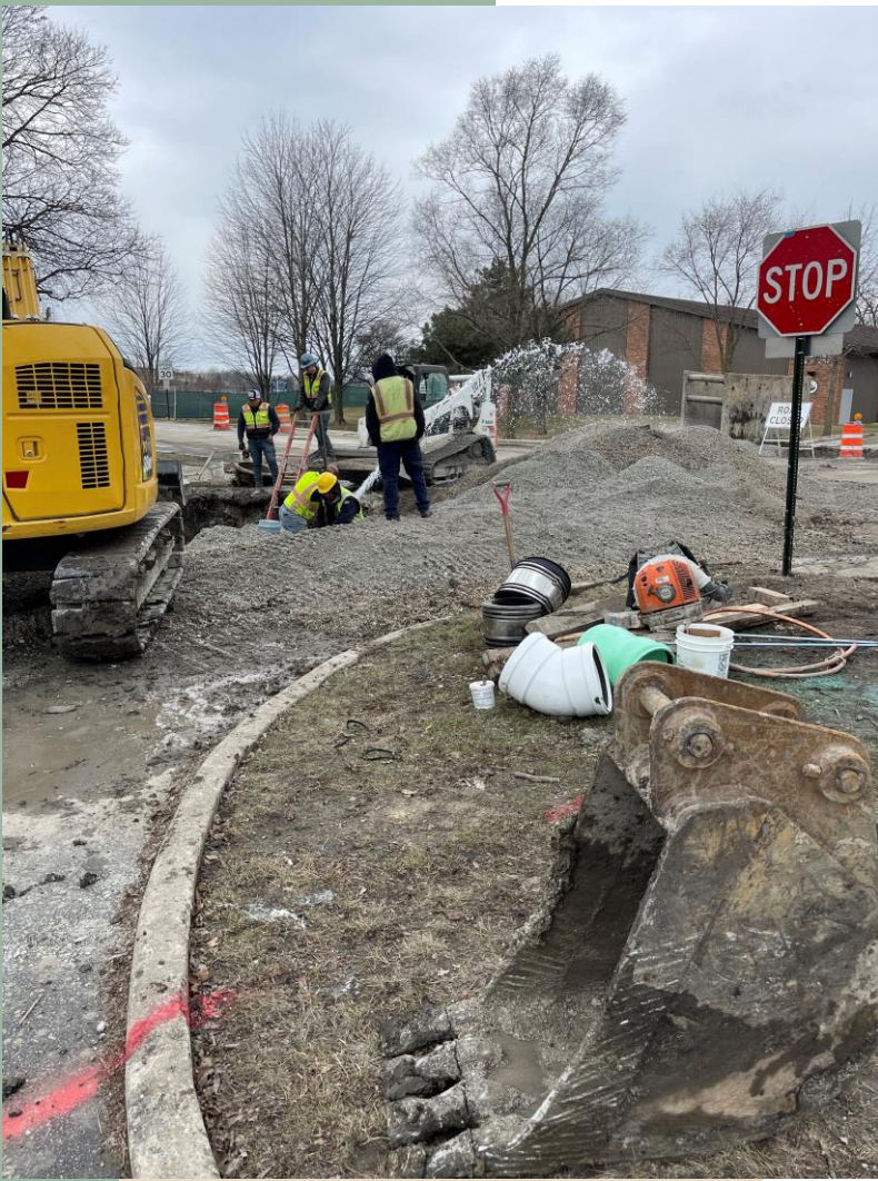
Testing of the previously installed water main occurred this week

HIBBARD ROAD TRAFFIC NOTICE: Hibbard Road will be under one-lane flagger control periodically over the next week. Please be on the lookout for construction workers and consider alternate routes.