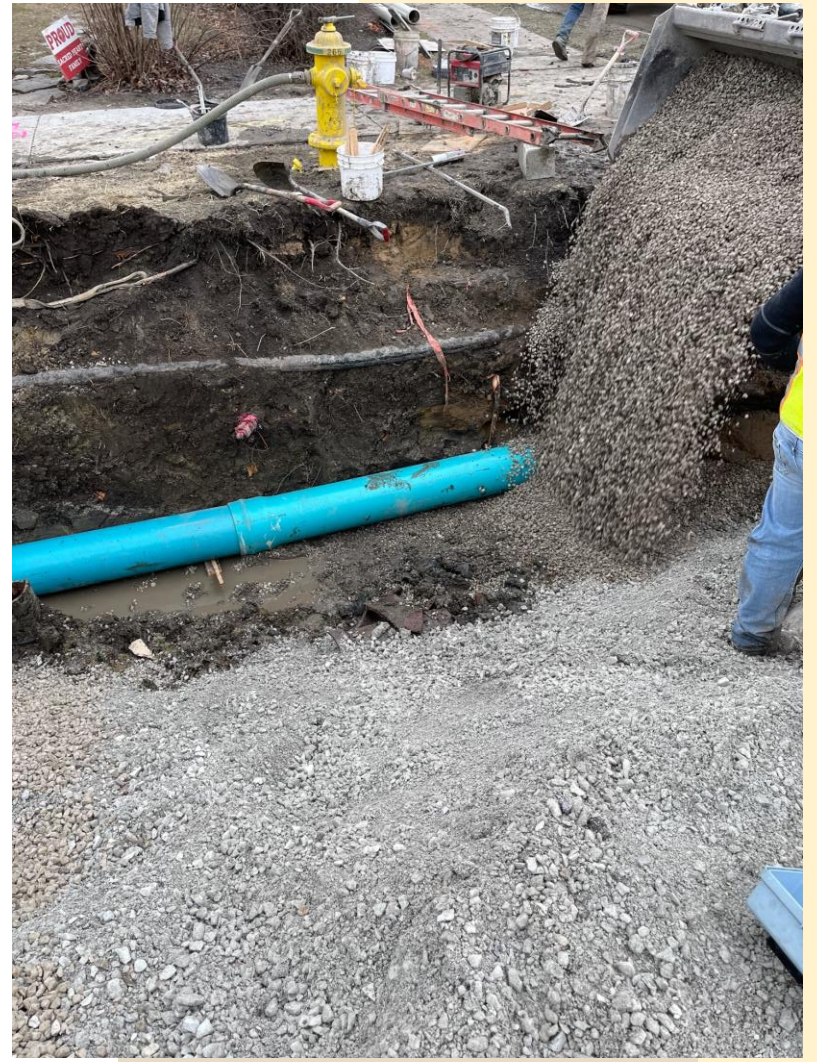
DiMeo installed several storm sewers along Oak Street during water main installation