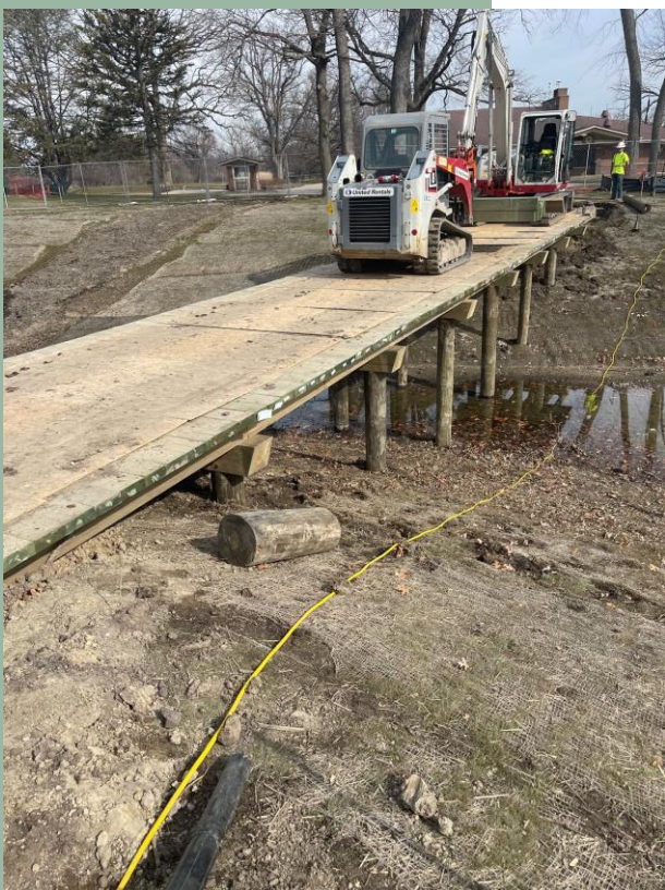
Construction on the first of three Par 3 Course bridges

HIBBARD ROAD CLOSURE NOTICE: Hibbard Road will be closed for construction between Willow Road and Elm Street starting on March 25 th and ending on April 2 nd . Please follow posted detour routes and use caution while driving in this area.