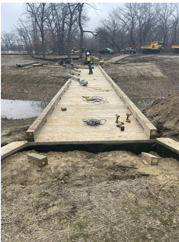
The Par 3 Course bridges crisscross the 4.6-million-gallon storage facility