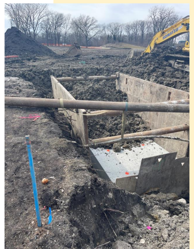
DiMeo installs 8'x4' box storm sewers out of Little Duke