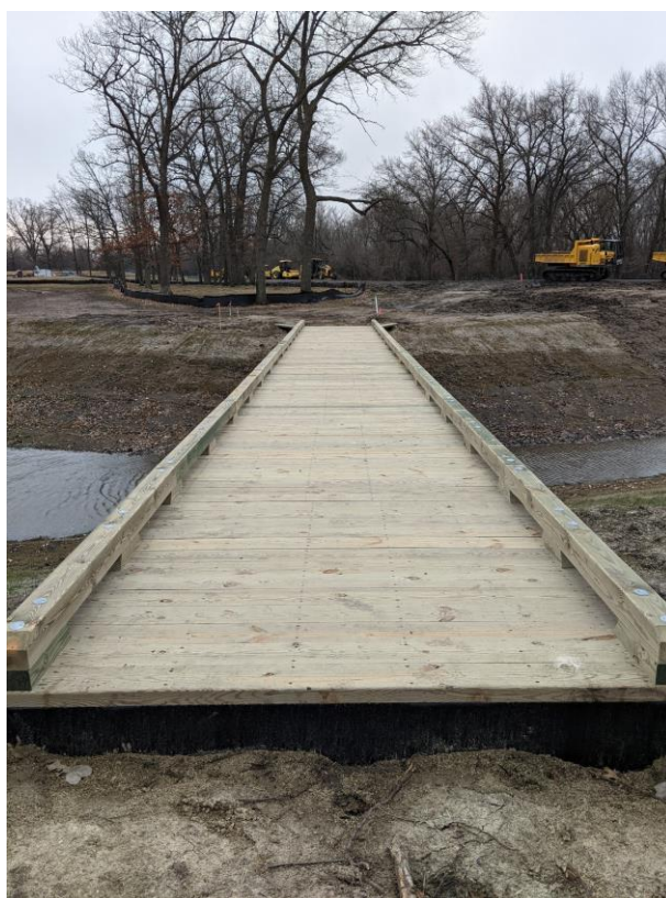
Completed bridge crosses the 4.6-million-gallon storage facility on the Par 3 Course