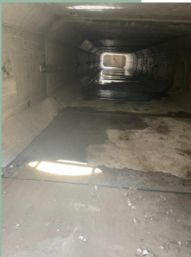
Inside of the Hibbard Road box storm sewer

HIBBARD ROAD TRAFFIC NOTICE: Hibbard Road reopen to normal traffic on April 2 nd . Hibbard Road will be under flagger control periodically over the next week. Please be on the lookout for construction workers and consider alternate routes.