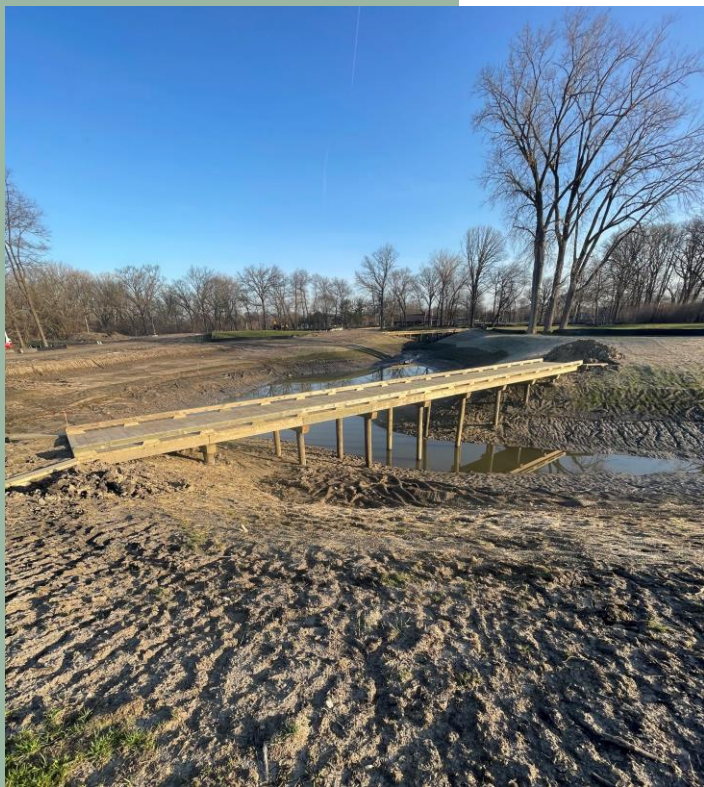
Par 3 bridges are complete