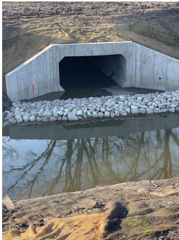
Water levels are down at the culvert connecting Par 3 to Little Duke