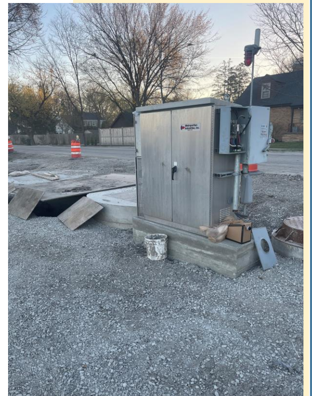
The control panel for the renovated Ash Street Pumping Station was relocated