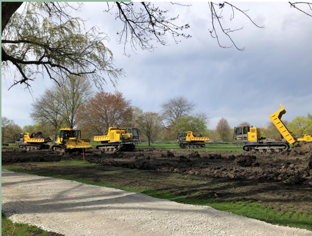
DiMeo's earthmoving equipment in action next to a newly-laid cart path base