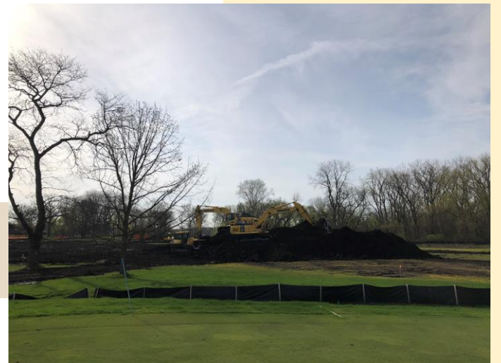
Topsoil was stripped and transferred to fill locations on the course