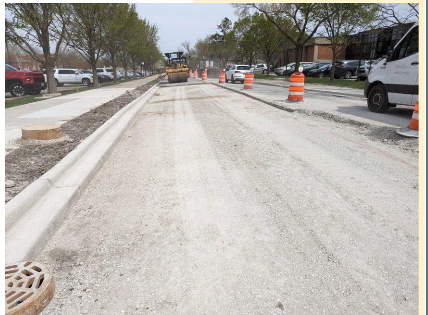
Roadway patching began on Hibbard Road. Surface course will be completed next week