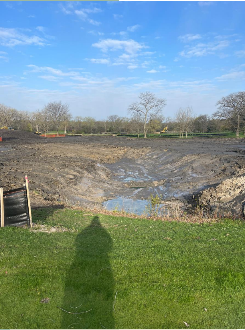
DiMeo continued to strip topsoil and dry out clay on the 18 th Hole before...