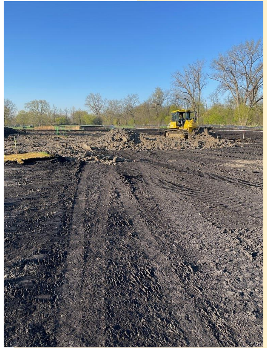
...transferring the dried clay to fill areas elsewhere on the course. This fill is intended to improve the playability following rain events