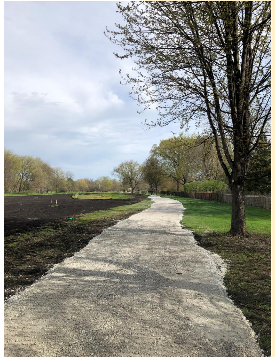
Cart paths throughout the golf course have begun to take shape alongside raised fairways