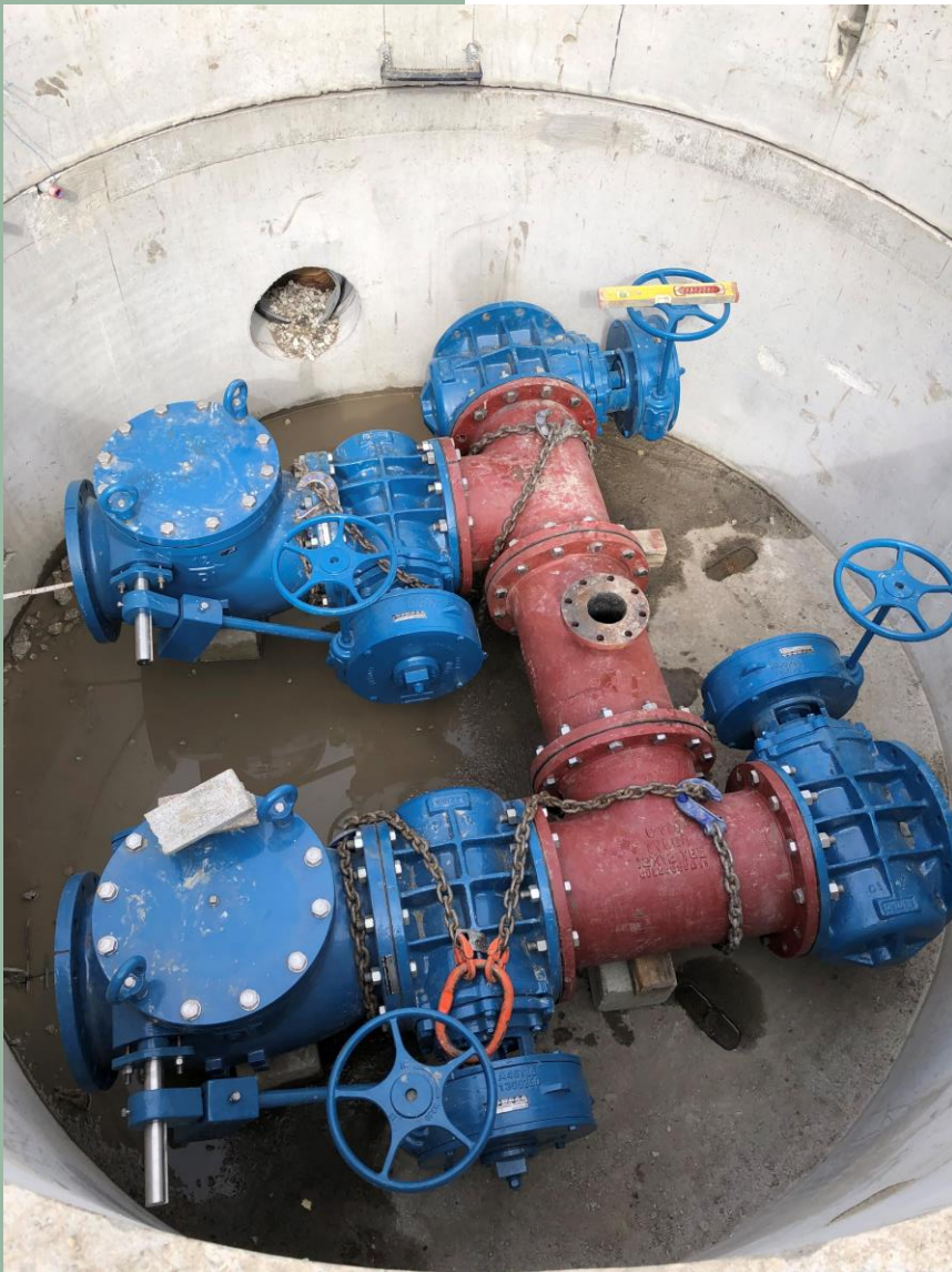
DiMeo installed valves at the Ash Street Stormwater Pumping Station