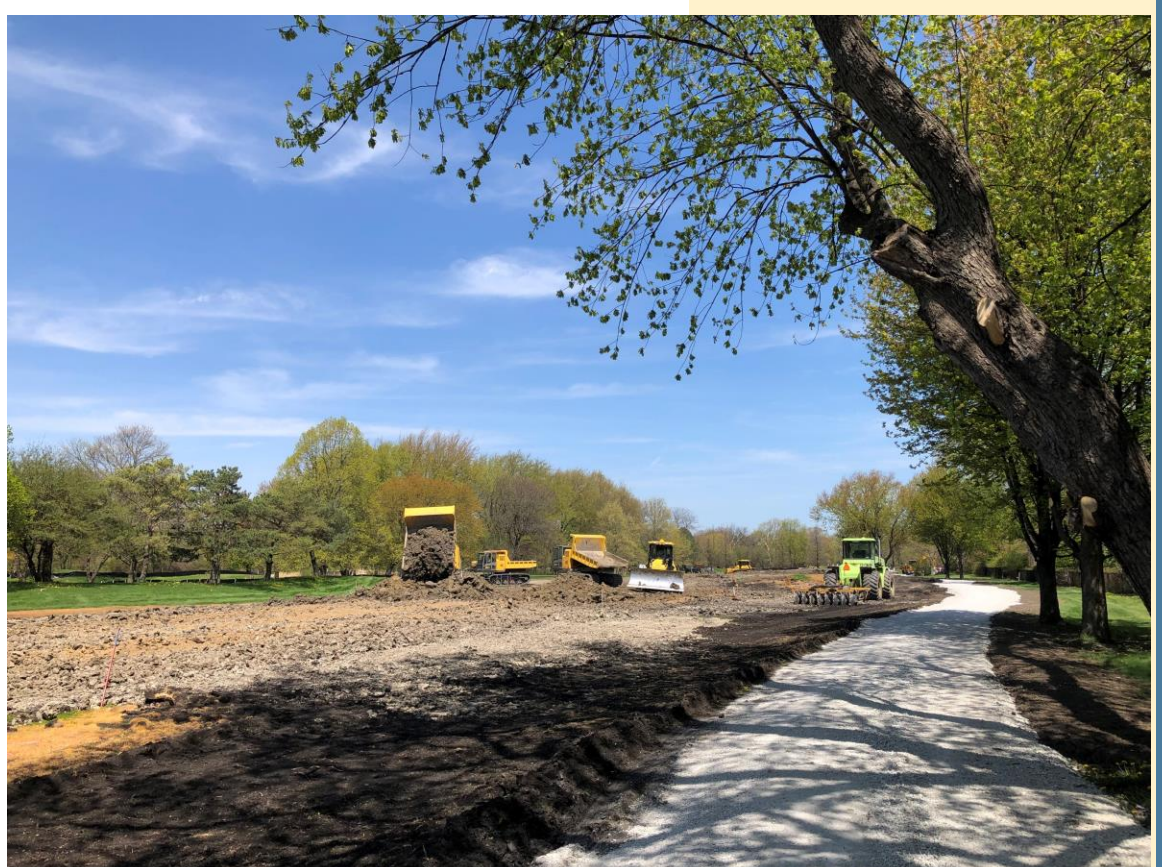
Topsoil stripping, earth excavation, filling, and grading operations continue at the golf course