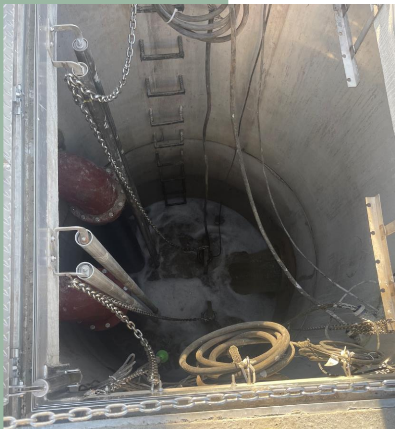
The Ash Street Stormwater Pumping Station is in its new location and up and running!