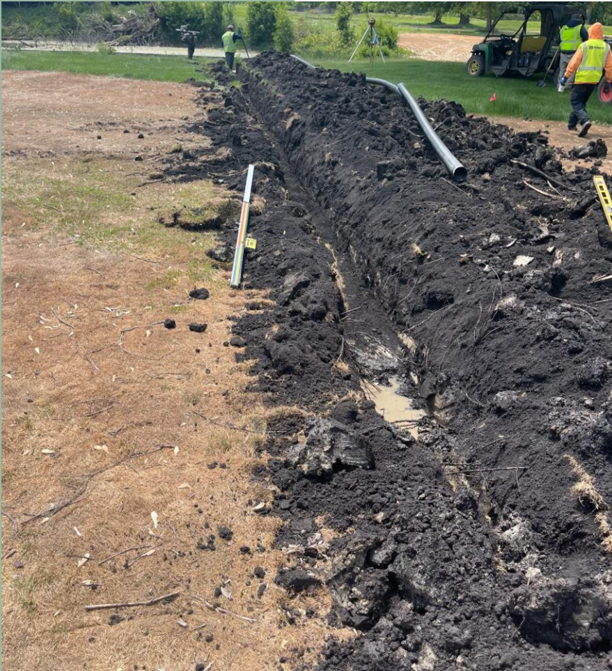
DiMeo and Wadsworth continue golf course work, filling and installing new drainage