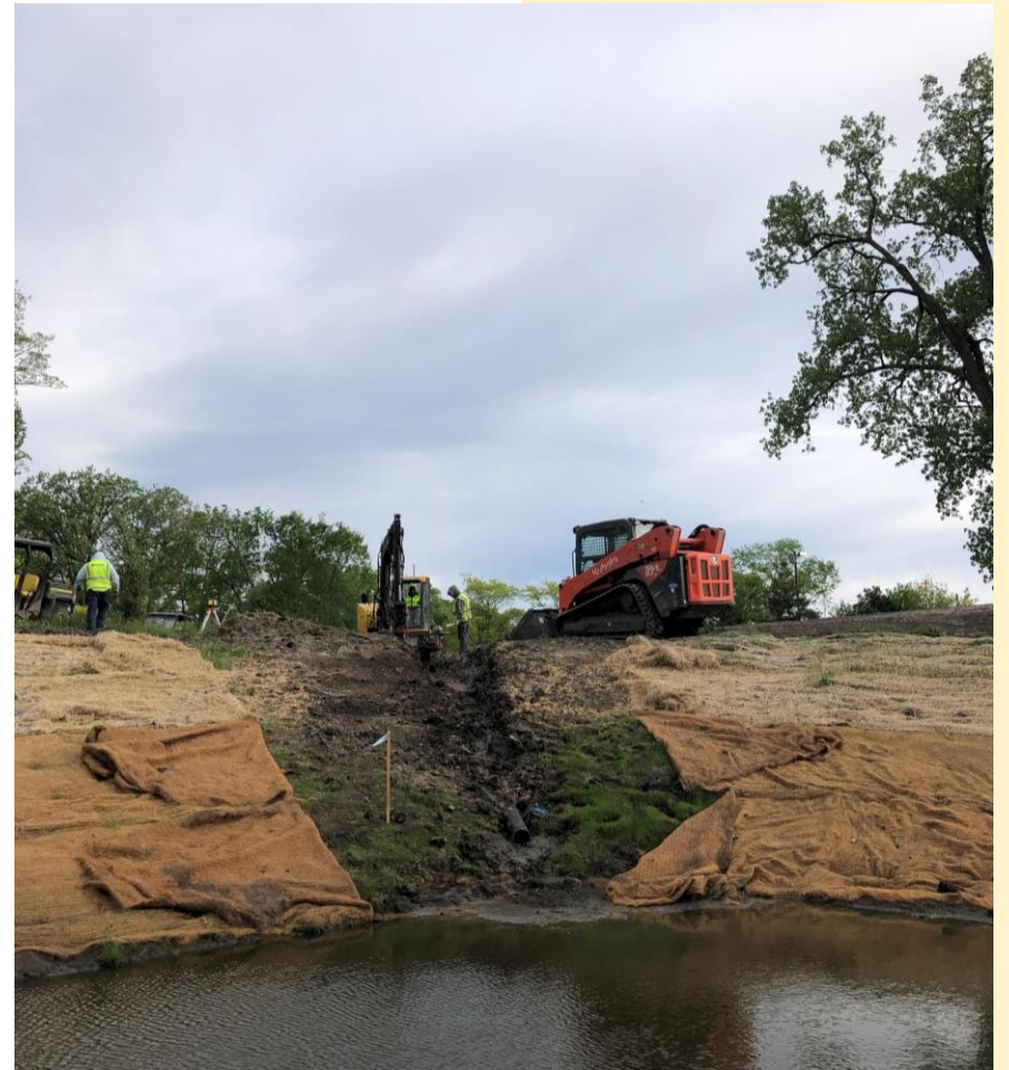
Wadsworth installs drainage between the Par 3 Storage Facility and the Ice Arena