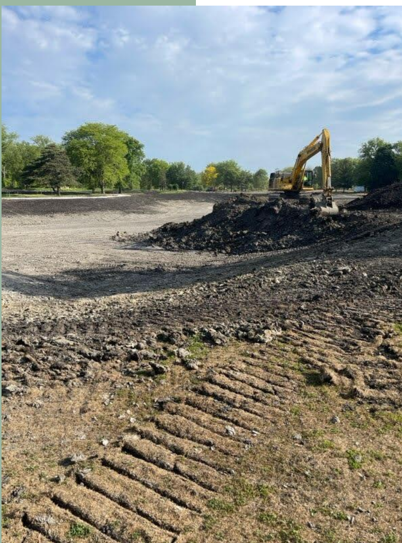
DiMeo continues to excavate the new No. 18 storage pond