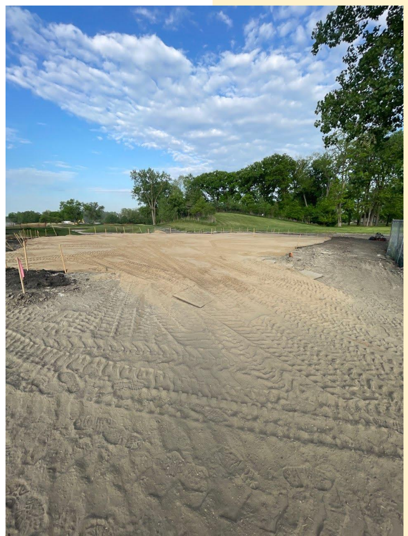
Wadsworth continues reconstruction of the No. 5 green on the Par 3 course